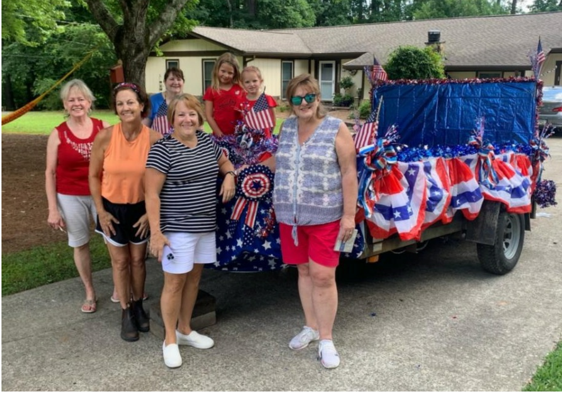
Dunwoody Idol Winner in the Parade and Beyond